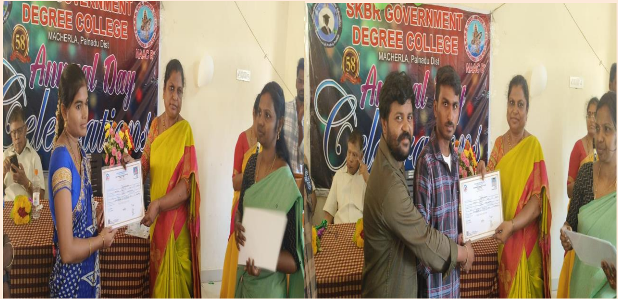
Certificate Distribution to the Skill Hub Students