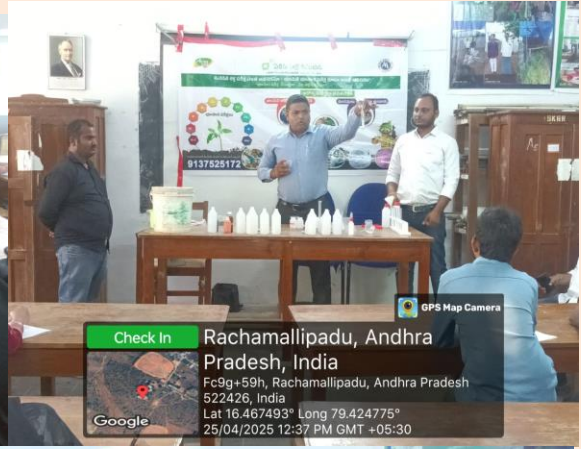
Check In Rachamallipadu, Andhra Pradesh, India Fc9g+59h, Rachamallipadu, Andhra Pradesh 522426, India Lat 16.467493° Long 79.424775° 25/04/2025 12:37 PM GMT +05:30