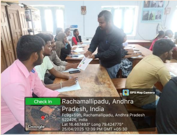
Check In Rachamallipadu, Andhra Pradesh, India Fc9g+59h, Rachamallipadu, Andhra Pradesh 522426, India Lat 16.467493° Long 79.424775° 25/04/2025 12:39 PM GMT +05:30