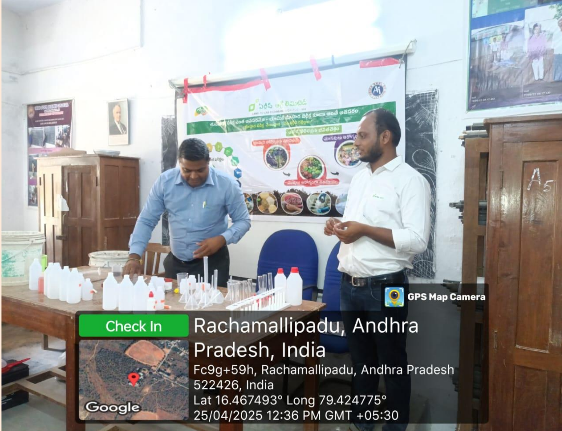
Check In Rachamallipadu, Andhra Pradesh, India Fc9g+59h, Rachamallipadu, Andhra Pradesh 522426, India Lat 16.467493° Long 79.424775° 25/04/2025 12:36 PM GMT +05:30