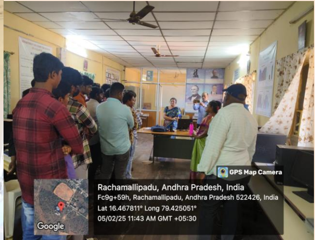
Rachamallipadu, Andhra Pradesh, India Fc9g+59h, Rachamallipadu, Andhra Pradesh 522426, India Lat 16.467811° Long 79.425051° 05/02/25 11:43 AM GMT +05:30