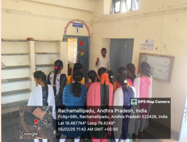
Rachamallipadu, Andhra Pradesh, India Fc9g+59h, Rachamallipadu, Andhra Pradesh 522426, India Lat 16.467744° Long 79.4249° 05/02/25 11:42 AM GMT +05:30