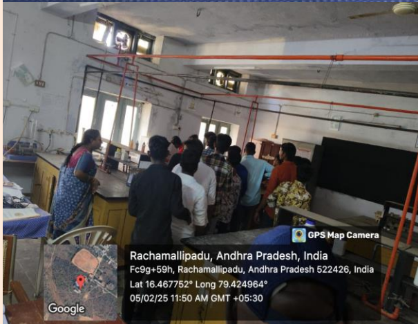
Rachamallipadu, Andhra Pradesh, India Fc9g+59h, Rachamallipadu, Andhra Pradesh 522426, India Lat 16.467752° Long 79.424964° 05/02/25 11:50 AM GMT +05:30