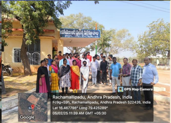
Rachamallipadu, Andhra Pradesh, India Fc9g+59h, Rachamallipadu, Andhra Pradesh 522426, India Lat 16.467798° Long 79.425289° 05/02/25 11:39 AM GMT +05:30