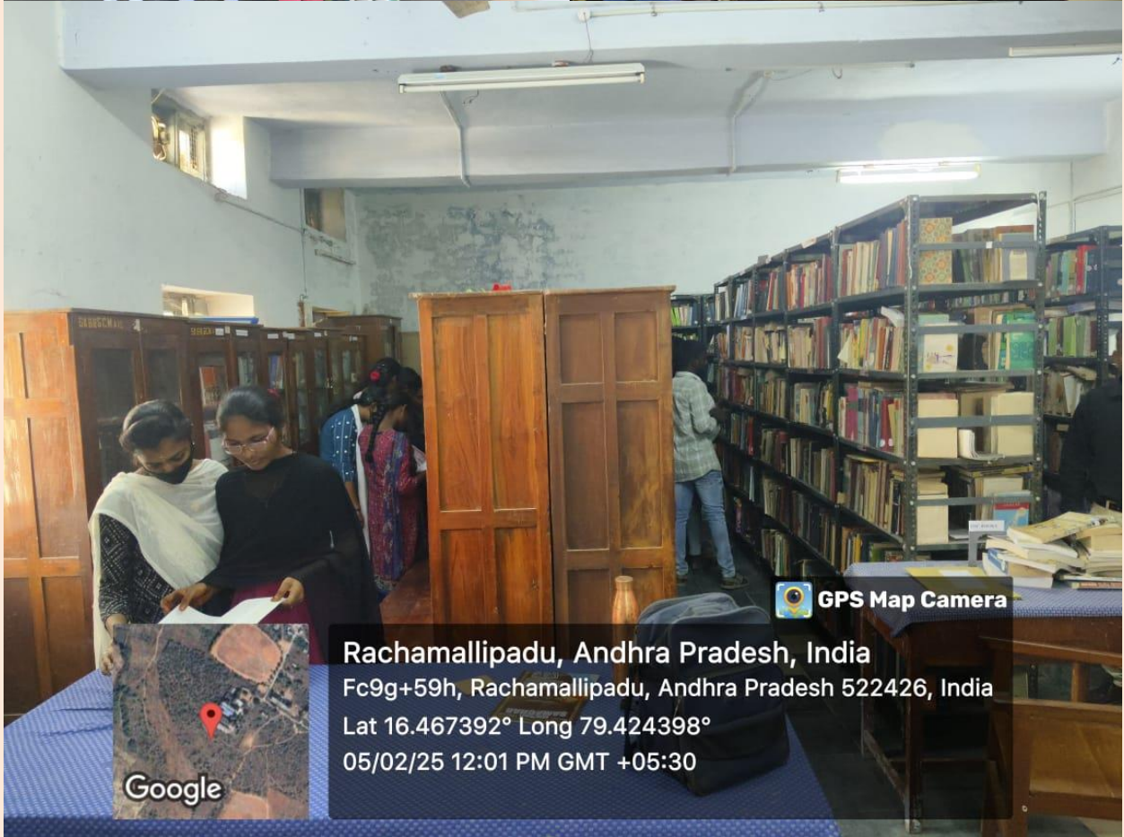
Rachamallipadu, Andhra Pradesh, India Fc9g+59h, Rachamallipadu, Andhra Pradesh 522426, India Lat 16.467392° Long 79.424398° 05/02/25 12:01 PM GMT +05:30